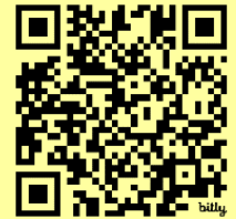
2023 Annual Report

On May 23 rd , 2024, Council presented their 2023 Annual Report at a Community Information Session. This Annual Report outlines the progress made on major initiatives supporting Council's strategic directions and also informs the public of the various initiatives Council will be undertaking moving forward.