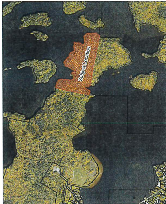
Figure 1: Subject Location identified in Schedule A of the Official Plan:

Permit Part 10 of Plan 23R-11403 to be severed from its original parcel of land, resulting in the creation of a 0.722 hectare recreational residential lot.